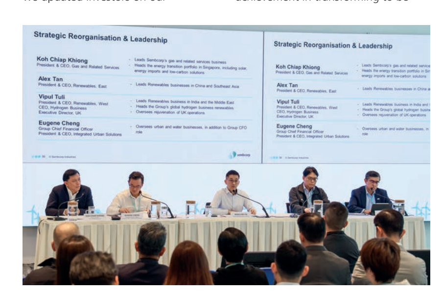
Management update on the strategic reorganisation at the 2024 full year results briefing

Sembcorp's commitment to governance and transparency has earned prestigious recognition. At the SIAS Investors' Choice Awards 2024, we received the Singapore Corporate Governance Award (Big Cap) and the Most Transparent Company Award (Utilities). At the Singapore Corporate Award 2024, Sembcorp was awarded the Special Recognition Award for Transformation, acknowledging our efforts and achievement in transforming to be